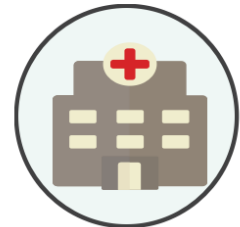
£242m avoided NHS treatment costs