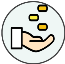
£1.1bn NHS cash savings