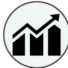
£1bn benefits to the public sector and wider economy