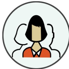
£600m benefits to patients