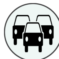
Reduced travel time