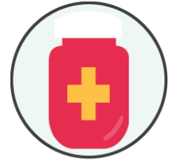
Support for self-care